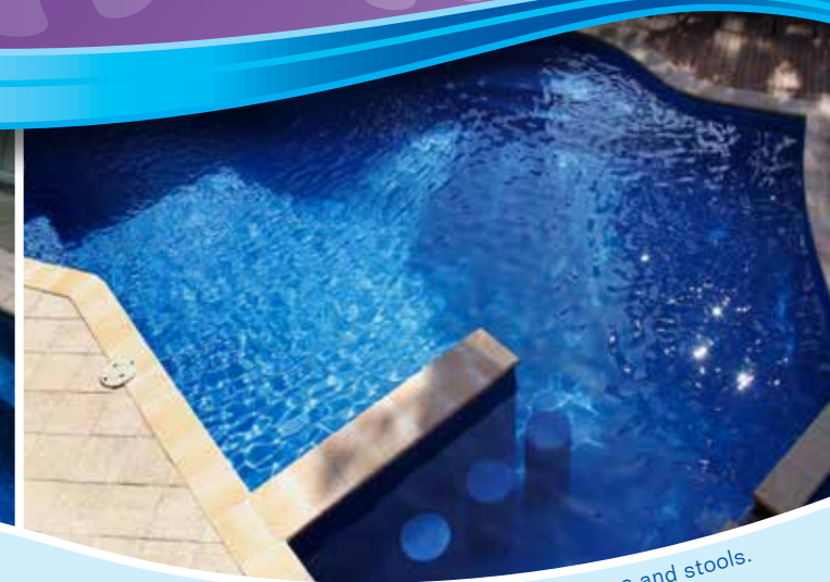
This Aqualux finish in 'Casablanca' included steps and stools.

Pool owners converting to Aqualux from pebble or tiled finishes are always amazed at how much easier it is to keep an Aqualux pool fresh and clean.