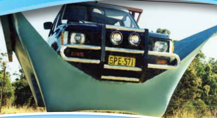
Aqualux supports the weight of a 4WD in this show of strength