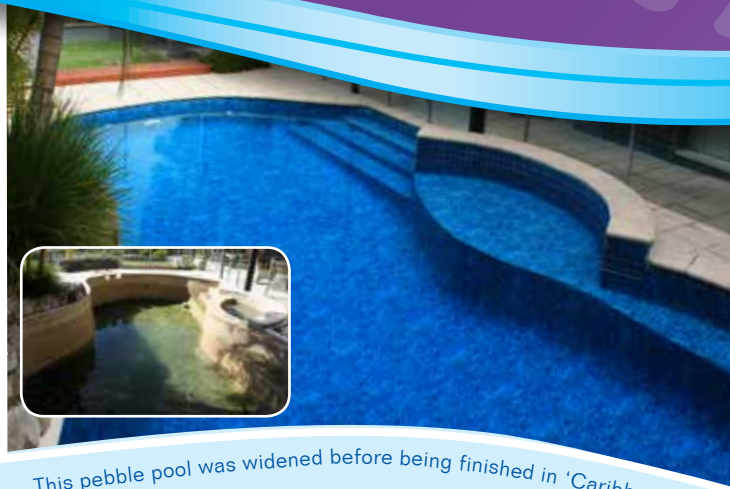
This pebble pool was widened before being finished in 'Caribbean'.

Whether it's a simple facelift for a dated pool, or a solution to ongoing leak repairs on a 'hard' surface finish, an Aqualux interior may be just what you are looking for.