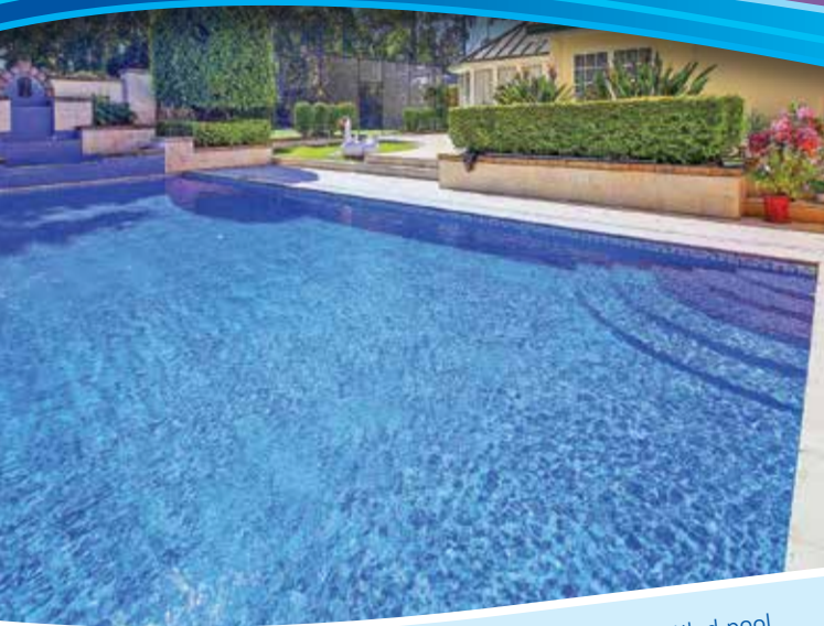
Aqualux in 'Maui' solved leak issues with this previously tiled pool.