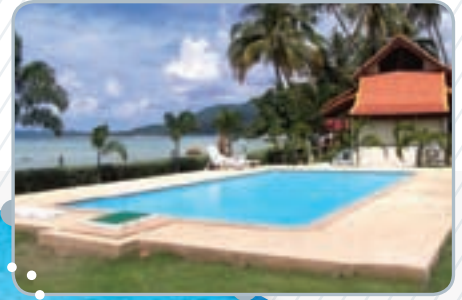
Resort Installation, Phuket, Thailand JD Pools*