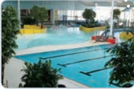
Bunbury Leisure Centre, WA, Australia AVP Constructions*

AquaForce can be purpose-joined in different colours to create shapes, which can be anything from lane markings to logos – all to your specifications