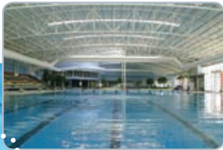
Bunbury Leisure Centre, WA, Australia AVP Constructions*

AquaForce forms the perfect leak-proof barrier between water and a variety of substrate materials such as concrete, stainless steel, timber and fibreglass. Due to its heavy gauge and surface bonding, AquaForce lays flat and resists wrinkling caused by expansion and contraction of the underlying substrate material and varying water temperatures.