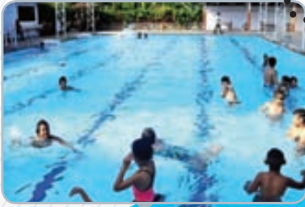
Swim Centre, Bangkok, Thailand JD Pools*