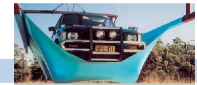
A demonstration of Aqualux™ toughness and durability

Providing a superior result in a pool of any shape, non-abrasive and soft to touch, Aqualux™ is the safest choice for your pool finish.