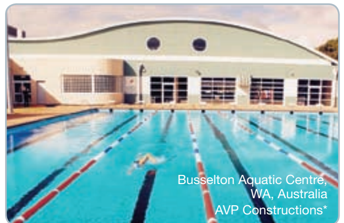
Busselton Aquatic Centre, WA, Australia AVP Constructions*