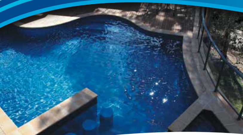
This Aqualux finish in 'Casablanca' includes multiple bar stools and steps.