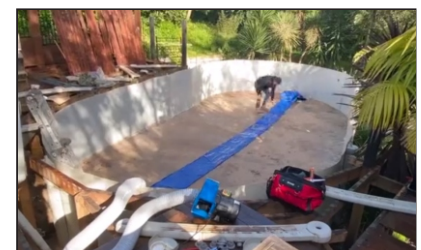
Put the liner wall up over the pool wall and hold in place with the plastic coping strips. Adjust the overlap to remove all wrinkles.